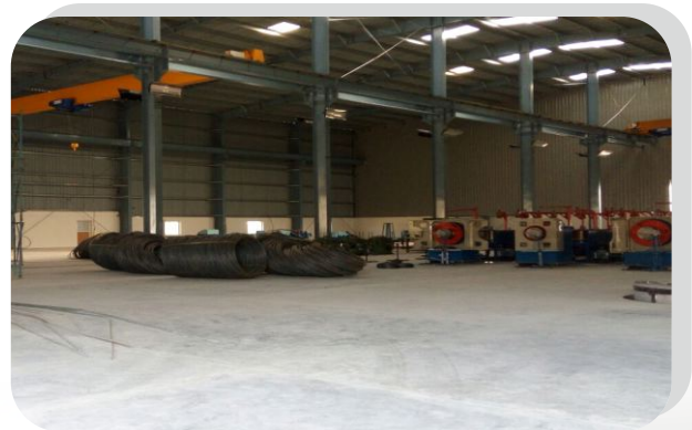
Vdf Flooring Of M/s K2 Metal Project Jejuri .m.i.d.c.