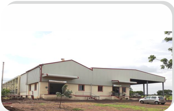
M/s Demech Chemical Products Pvt.ltd.baramati M.i.d.c