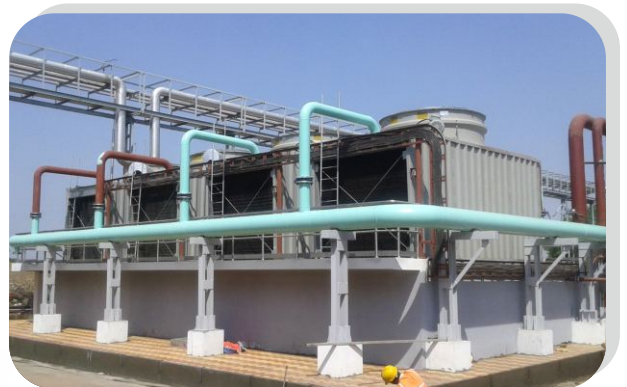
Cooling Tower Project Of Shreiber Dynamix Ltd, Baramati,