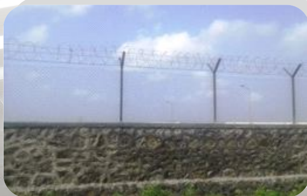
UCR Wall & Fencing Work