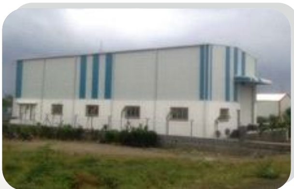
Sai Malhar Project at Jejuri M.I.D.C