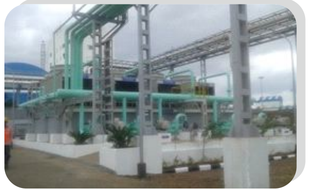
Cooling Tower Piperack Work