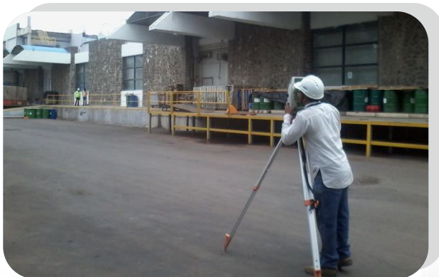
SDDL Baramati Survy