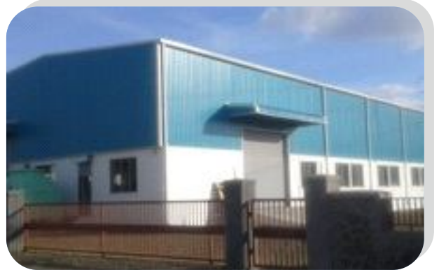
M/S. DASGUNA .I. @ Jejuri M.I.D.C.