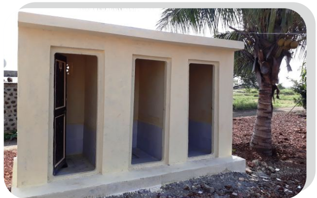
Toilet block- PIAGGIO