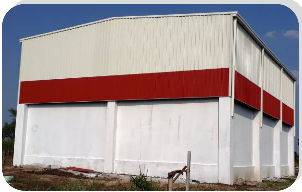
AIS- SAINT GOBAIN