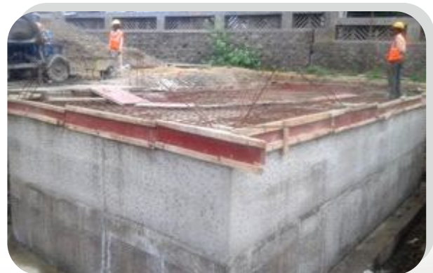
K2 Metal Fire Water Tank Jejuri