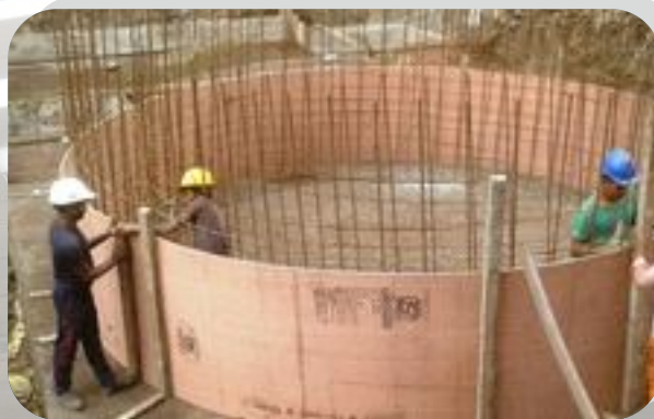
ISMT Stack Foundation- Jejuri