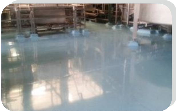
Epoxy Work at SDDL Project Baramati