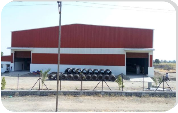
K2 Metal Project @ Jejuri M.I.D.C.