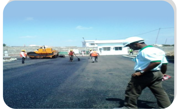
Construction of B.Road Work @ BOILER HOUSE @ Kurkuam M.I.D.C.