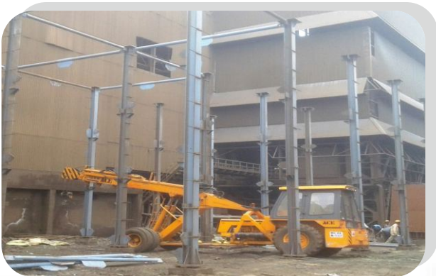
M/s Ismt Project Jejuri .M.I.D.C.