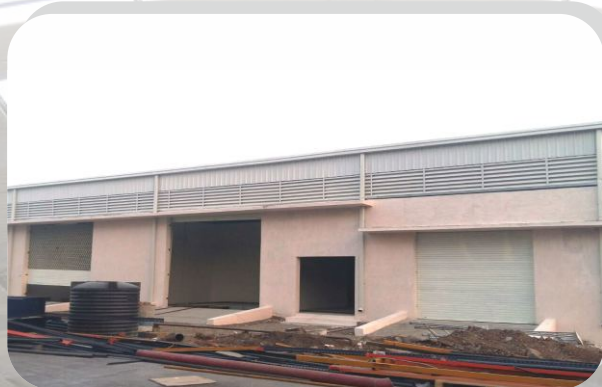
M/s Imsofer..baramati M.i.d.c