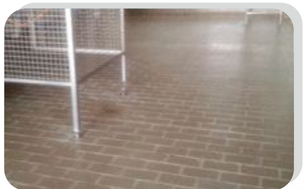
A.R.Tilling Work at SDDL Project Baramati